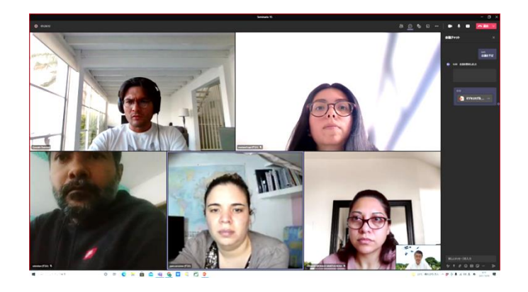
3 JICA Mexican trainees

We regularly accept Mexican trainees through the Japan-Mexico Strategic Partnership Program, which is a part of JICA's initiatives (currently online base due to COVID19). Most of the participants have taken education and research at universities and vocational careers; I hope that collaboration with Japanese students who belong to our laboratories will produce results that incorporate a cross-cultural perspective.