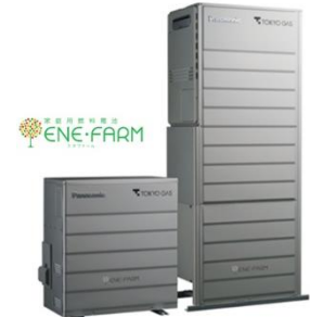
Fig1 Fuel Cell for Residence

山本 高広, 住吉大輔, 崔榮晋, 実住宅を対象とした詳細計測に基づく家庭用燃料電池の省エネルギー効果および電力負荷追従性能に関する研究, 日本建築学会環境系論文集, 2020, 85 巻, 767 号, p. 45-54