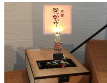
Fig3 Sample Device for Energy Usage Behavior Change