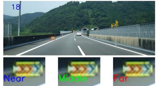
Fig. 1 Example of output image for detect of traffic sign board.

There are many cases of crews involved in accidents on the road because of missing or recognition delay of traffic sign board by drivers. To prevent these cases, we try to develop on detection of traffic sign board using a vehicle camera. Fig.1 show the example of result image to detect of traffic sign board in highway.