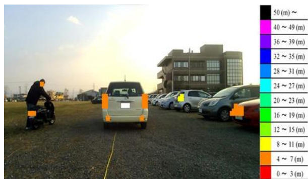
Fig.3 Example of measuring distance to leading vehicle.

We focus on the feature of color on the taillights in vehicle and motorcycles, it is extracted by template matching and it is measuring of distance from ourselves. In addition, this system can be detected a walker of the street intersection. Fig.3 show the example of measuring distance to leading vehicle.