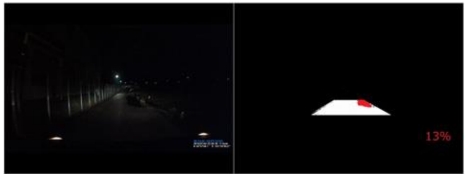
(a) Input image

If there is a water pools on the road at night, it will be very dangerous because the steering wheel may be removed in bicycle. We focus on the feature of reflected light, it is specular or diffuse reflection. Fig.2 show the example of detection the water pool on the road at night.